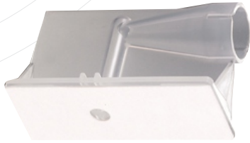
CYTO FUNNELS WITH FILTER PAPERS