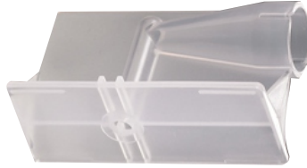
CYTO FUNNELS ONLY